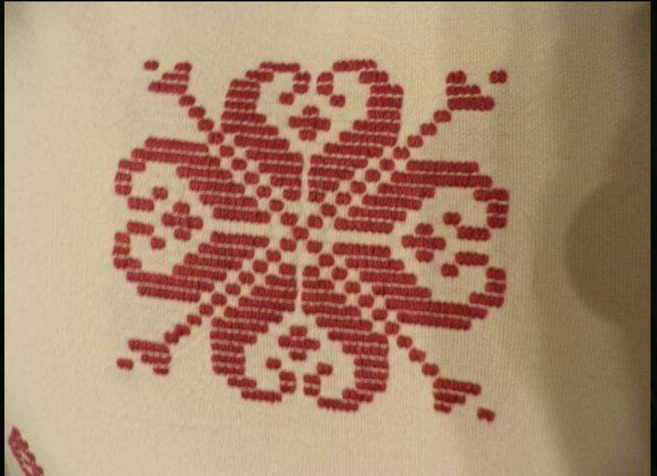
embroidery of the loom